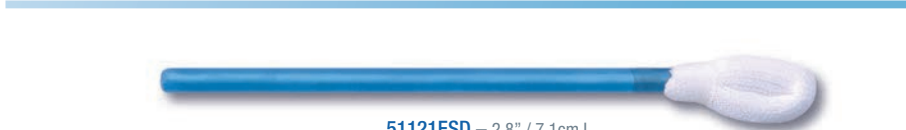
51121ESD – 2.8" / 7.1cm L