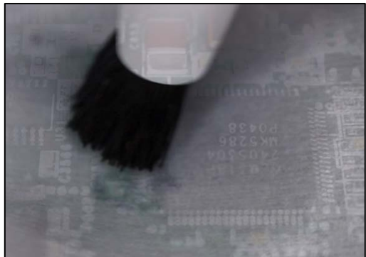
Lightly spray and scrub over connectors