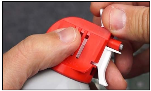
Remove safety-lock tab