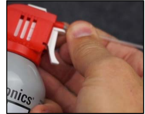
Straw attachment for spraying into tight areas, like under low standoff components