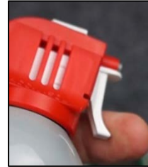
No attachment for cleaning or rinsing large areas

There is a common misconception that you can spray flux residues or swab with isopropyl alcohol and the contamination will evaporate with the solvent. What actually happens is the solvent evaporates but leaves the residue behind. This might hide the problem, since the flux is spread over a wider area, but the potential for corrosion and dendritic growth from ionic contamination hasn't changed. Using a wipe in combination with the brush allows you to not only break down and dissolve the