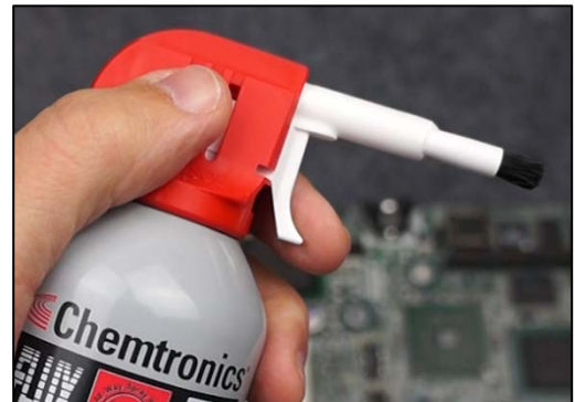
BrushClean attachment for controlled cleaning to avoid cross contamination and minimize solvent usage